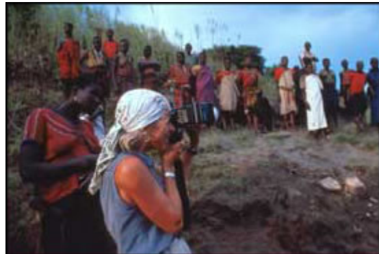
On the Blue Nile River, Ethiopia